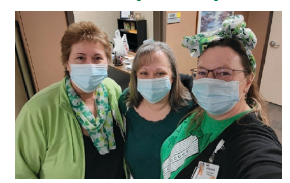
Patient Access and Patient Financial Services